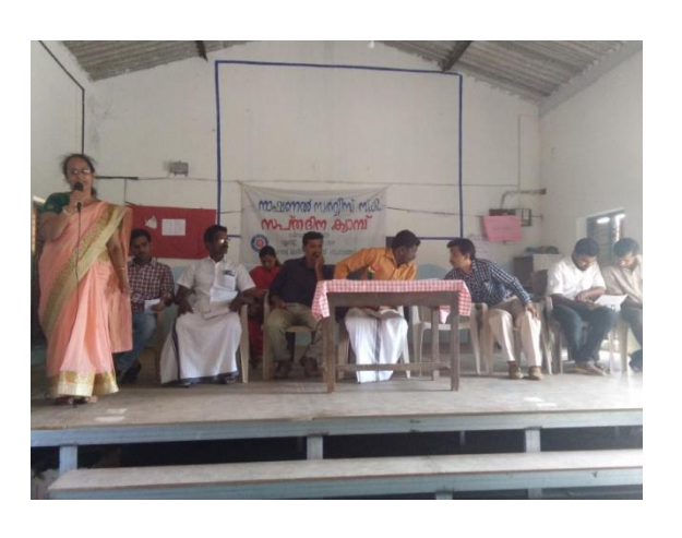
seven day special camp