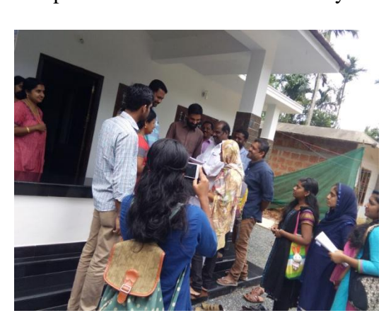
Survey on water resource management